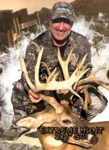
EXTREME HUNT 289" SCI