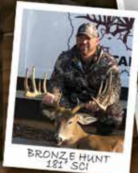
BRONZE HUNT 181" SCI