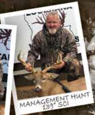
MANAGEMENT HUNT 139" SCI