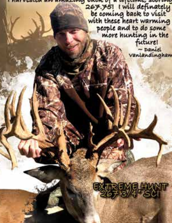
EXTREME HUNT 267 3/4" SCI